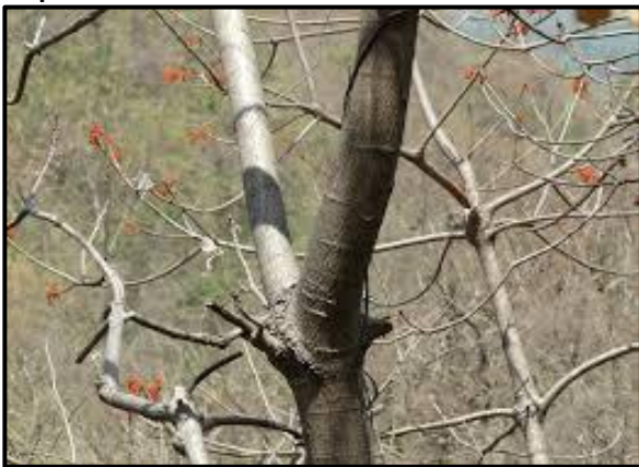
Fig. 1: Udal Tree