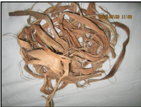
Fig. 2: Udal Fiber