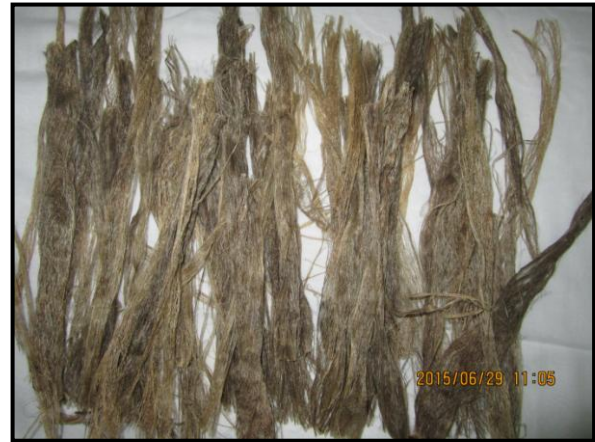
Fig: Udal fiber after treatment with NaOH solution